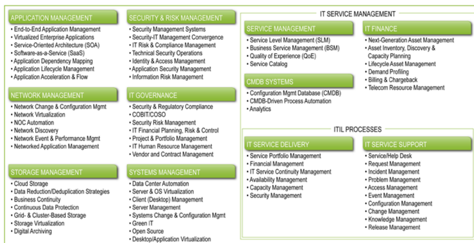
EMA Practice Areas

This affordable service provides subscribers with insight into topics that span our practice areas, including: